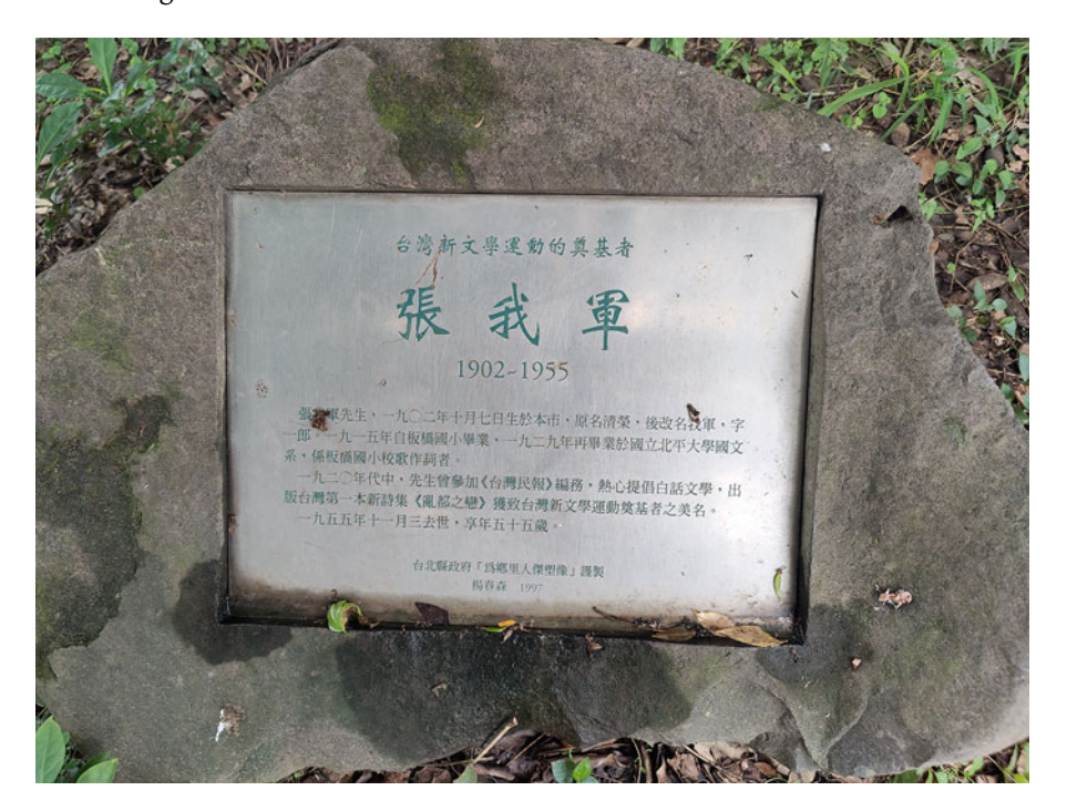
Figure 3. Plaque at Banqiao Elementary School. This plaque indicates Zhang's importance to Taiwan's literary development and his contributions to the school, including his writing of the school song.