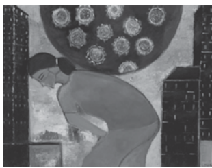
Title: Oversized, Overwhelming Impact of COVID-19, 2020

Beginning with volume 43 (January 2022), the cover of Infection Control & Hospital Epidemiology (ICHE) will feature art inspired by or reflective of topics within the scope of the journal and their impact on patients, healthcare personnel and our society. These topics include healthcare-associated infections, antimicrobial resistance, and healthcare epidemiology. The intent is to feature original artwork that has been created by individuals who have a personal connection to one or more of these topics through their clinical work, research, or experience as a patient or an affected patient's family member, friend or advocate. The goal is to provide readers with a visual reminder of the human impact of the topics addressed in the journal and the importance of the work being done by those who read or contribute to ICHE and by all who are trying to make healthcare safer through the elimination of healthcare-associated infections.