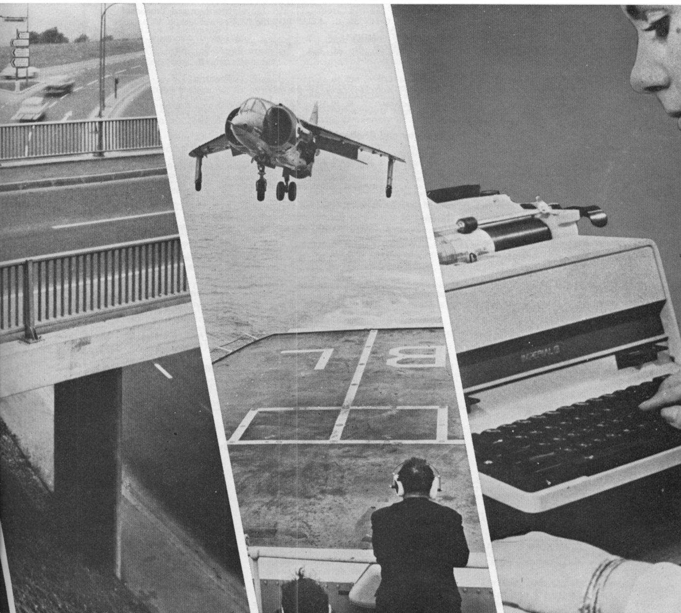
Bridge railing in H.D.A. extrusions.

Hawker Siddeley Group supplies mechanical, electrical and aerospace equipment with world-wide sales and service.