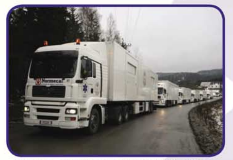
All kinds of clinics or hospitals in MultiSpace