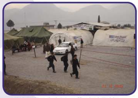
Cuban Hospital, Muzaffarabad, Pakistan