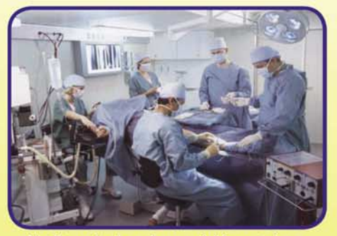
NorBase single and expandable containers

Number One in the world for partial and turn key solutions incl. Transportation, Erection, Management, Training, Maintenance, Education, Administration, Storage, Out sourcing, Medivac. etc.