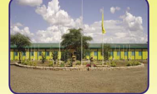
KATIKO Referral Hospital, Southern Sudan