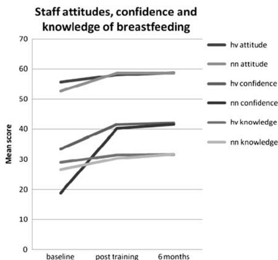
Figure 2 Health visitor (HV) and nursery nurse (NN) attitudes and knowledge of breastfeeding, and their confidence in helping breastfeeding mothers before and after BFI training ( n = 98 with data at all time points).

scores for nursery nurses. Repeated measures ANOVA tests confirmed that there were no significant differences after training over time or between staff groups (attitudes P = 0.752 ; knowledge P = 0.423 ; self-efficacy P = 0.678 ).