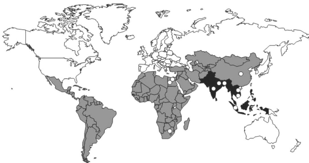
Fig. 1. Geographic distribution of population-based studies of typhoid fever incidence. (Adapted from Crump et al. [1].) ■, High incidence (>100 episodes/100 000 per year); ▒, Medium incidence (10–100 episodes/100 000 per year); □, Low incidence (<10 episodes/100 000 per year); □, region with human development index (HDI) countries; ○, site of contributing disease incidence study.