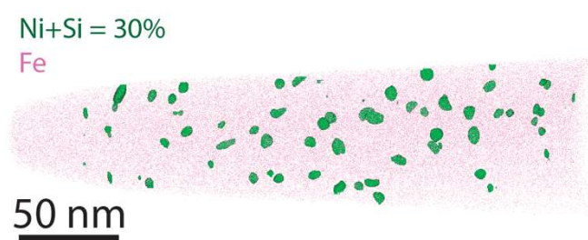
Figure 1. Atom probe reconstruction of the material irradiated to 100 dpa. Green isoconcentration surfaces represent Ni-Si rich precipitates. The extent of the analysis is shown by a small number of the Fe atoms in pink.