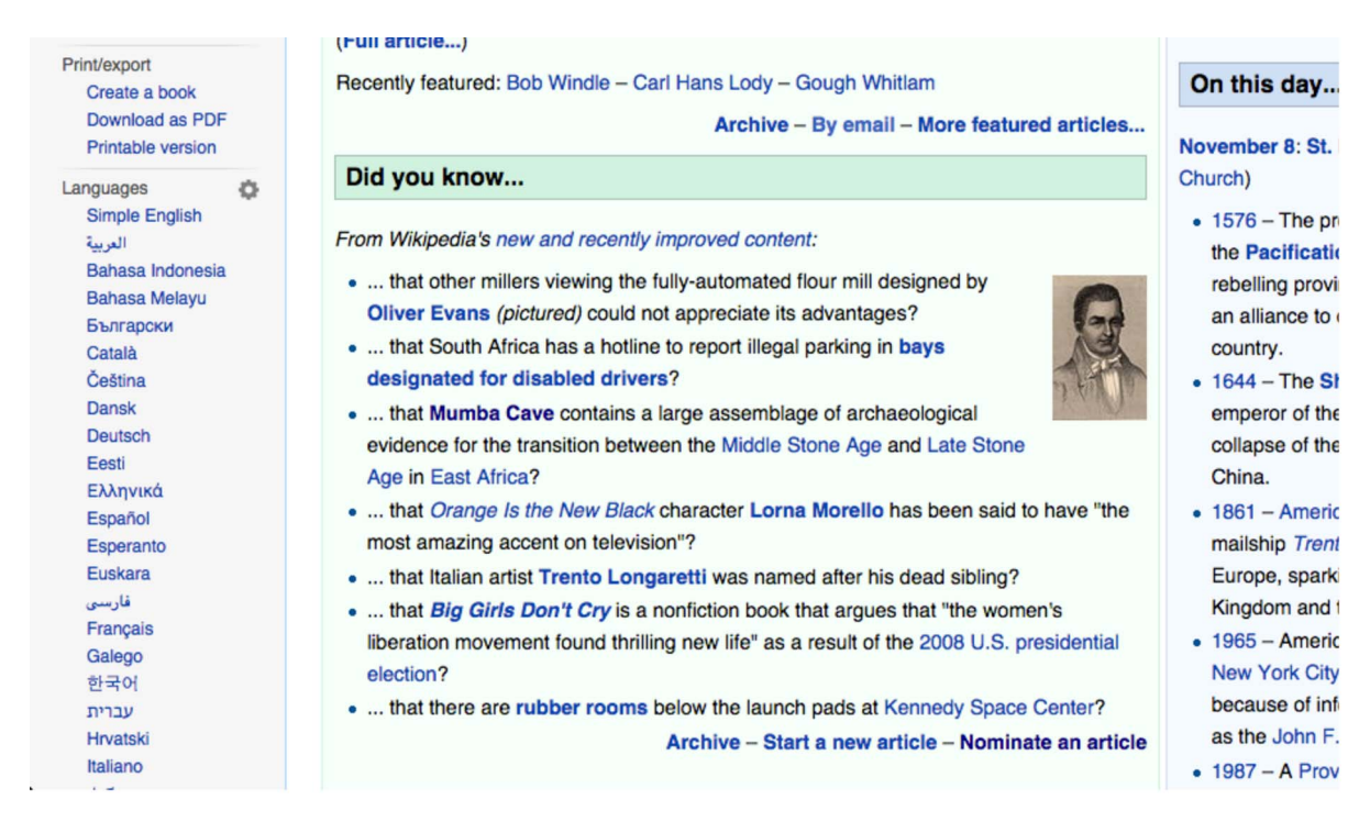
FIGURE 3. Screenshot of the "Did You Know..." section featuring Mumba Cave.