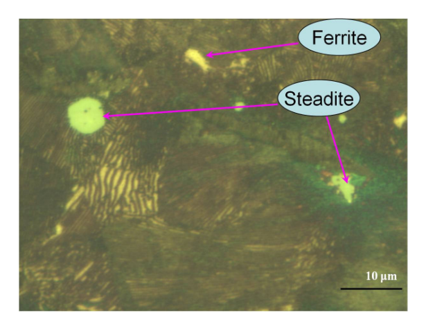
Figure 2. Microstructure of cast iron etched with selenic etchant, which differentiates the ferrite and steadite microconstituents as yellow and green colour respectively

Figure 1. Microstructure of cast iron etched with normal etchants such as nital and picral, which reveals both the ferrite and steadite microconstituents appears as white color under optical microscope