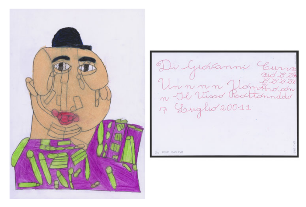
Fig. 1. Un n n n Uommo con n Il Visso Rottonnddo, 2011.