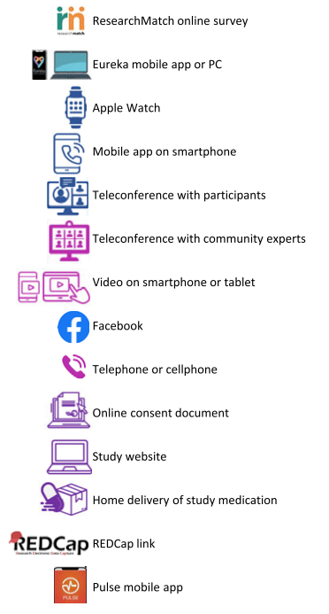
Figure 3. Examples of decentralized elements in Trial Innovation Network hybrid trials.

REACT-AF: Rhythm Evaluation for AntiCoagulaTion with Continuous Monitoring of Atrial Fibrillation,<sup>14</sup> NCT05836987 PREVENTABLE: PRagmatic EValuation of EvENTs And Benefits of Lipid-Lowering in Older Adults,<sup>16</sup> NCT04262206 TREAT Now: Trial of Early Antiviral Therapies during Non-hospitalized Outpatient Window,<sup>21</sup> NCT04372628 OIAC19: Outcomes of Infants Affected by COVID-19<sup>23</sup> (Observational trial)