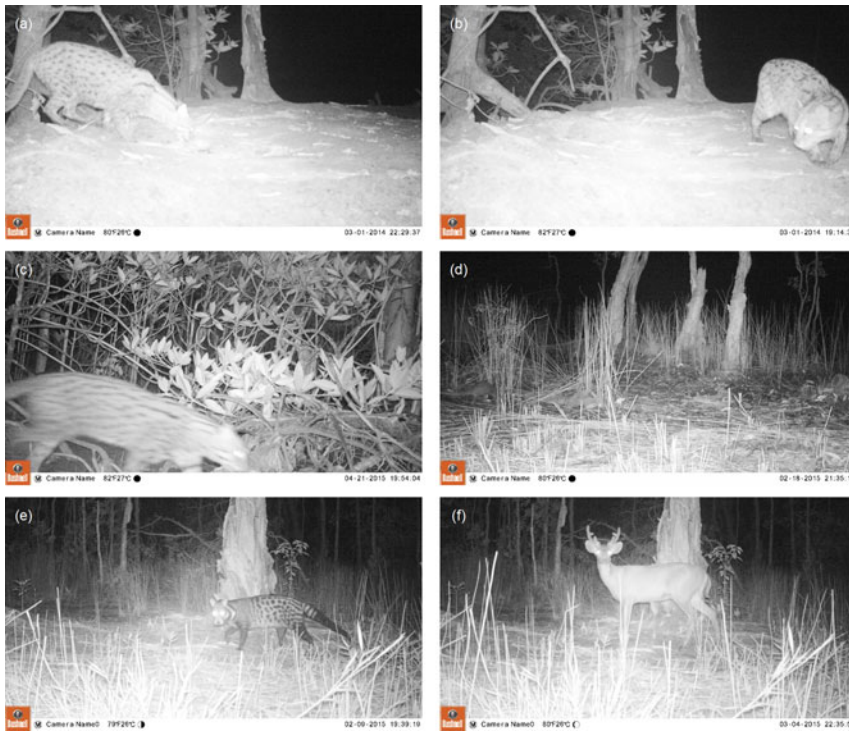
PLATE 1 Camera-trap photographs of (a, b) fishing cat Prionailurus viverrinus , Peam Krasop Wildlife Sanctuary, (c) fishing cat, Ream National Park, and (d) Sunda pangolin Manis javanica , (e) large-spotted civet Viverra megaspila , and (f) hog deer Axis porcinus , in coastal mangroves of southern Cambodia.

Video S1) and defecating (Supplementary Video S2). One video showed a wet cat, apparently having emerged from the water (Supplementary Video S3). A fishing cat was photographed at station 9 in Ream National Park (Plate 1). There were no records of fishing cats from either Prey Nup or Botum Sakor. Both trap stations that recorded the fishing cats were located in mangrove forests. The station at Peam Krasop was also visited by smooth-coated otters Lutrogale perspicillata , common water monitors Varanus salvator , long-tailed macaques Macaca fascicularis , and people and their domestic dogs (Table 2). The station at Ream National Park was also visited by a leopard cat Prionailurus bengalensis , common palm civets, Javan mongooses Herpestes javanicus and people.