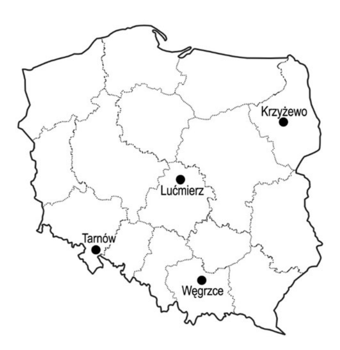
Fig. 1. Map of Poland showing the locations of the experimental sites.

To compare the potato tuber yield in organic and conventional systems a Bayesian hierarchical model was used. For clarity, throughout the paper by 'environment' we mean a combination of year and location, and by 'trial' we mean a combination of environment and system. For identification, environments (Table 3) and trials were numbered. In the data set, the organic trials were numbered from 1 to 12, whereas the conventional trials were numbered from 13 to 24.