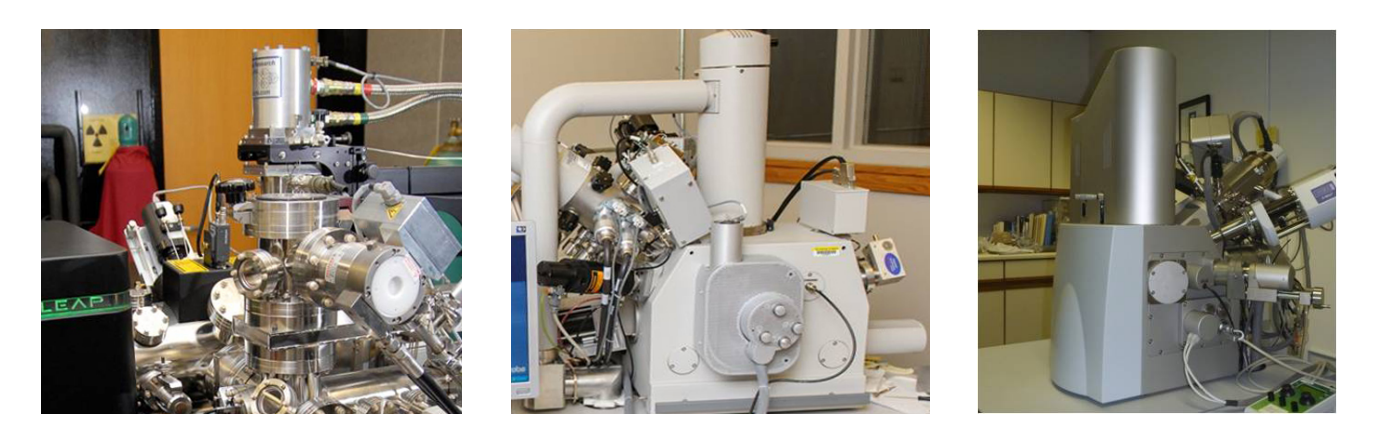
Fig. 1: (a) Cameca's LEAP 3000XSi. (b) FEI's Quanta 200 3D FIB/SEM. (c) TESCAN's LYRA-3 XMU FIB-FESEM