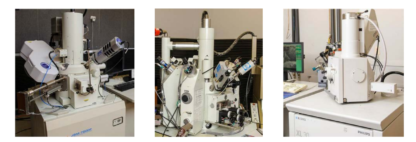
Fig. 2: (a) JEOL 7000 FESEM. (b) JEOL 8600 Electron Microprobe. (c) Phillips XL-30.