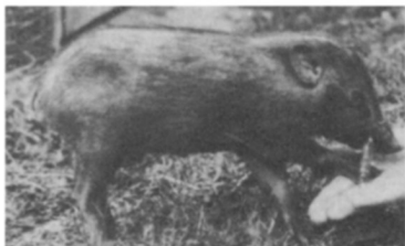
Pygmy hog, reared by Mrs Robin Wrangham in Assam, the first of this rare species known to have been raised in captivity

The latest estimate of the Javan rhino population of the Udjung Kulon reserve in western Java, the animal's sole remaining known locality, is 40–48, including at least one very small calf. This represents a great increase from the estimate of under 30 only a few years ago.