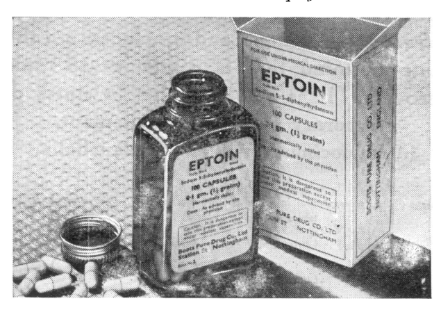
Obtainable through all branches of