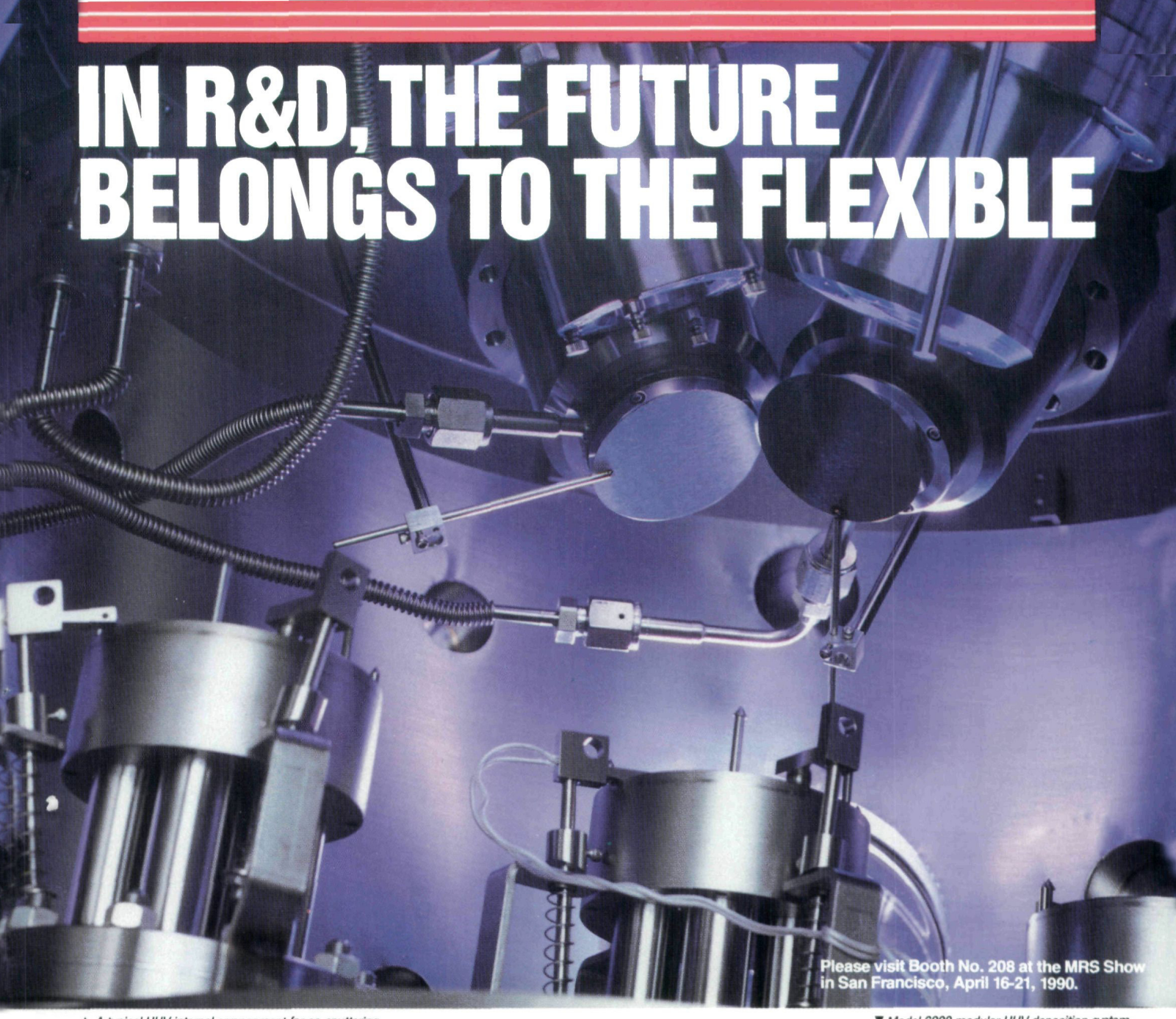
▲ A typical UHV internal arrangement for co-sputtering.