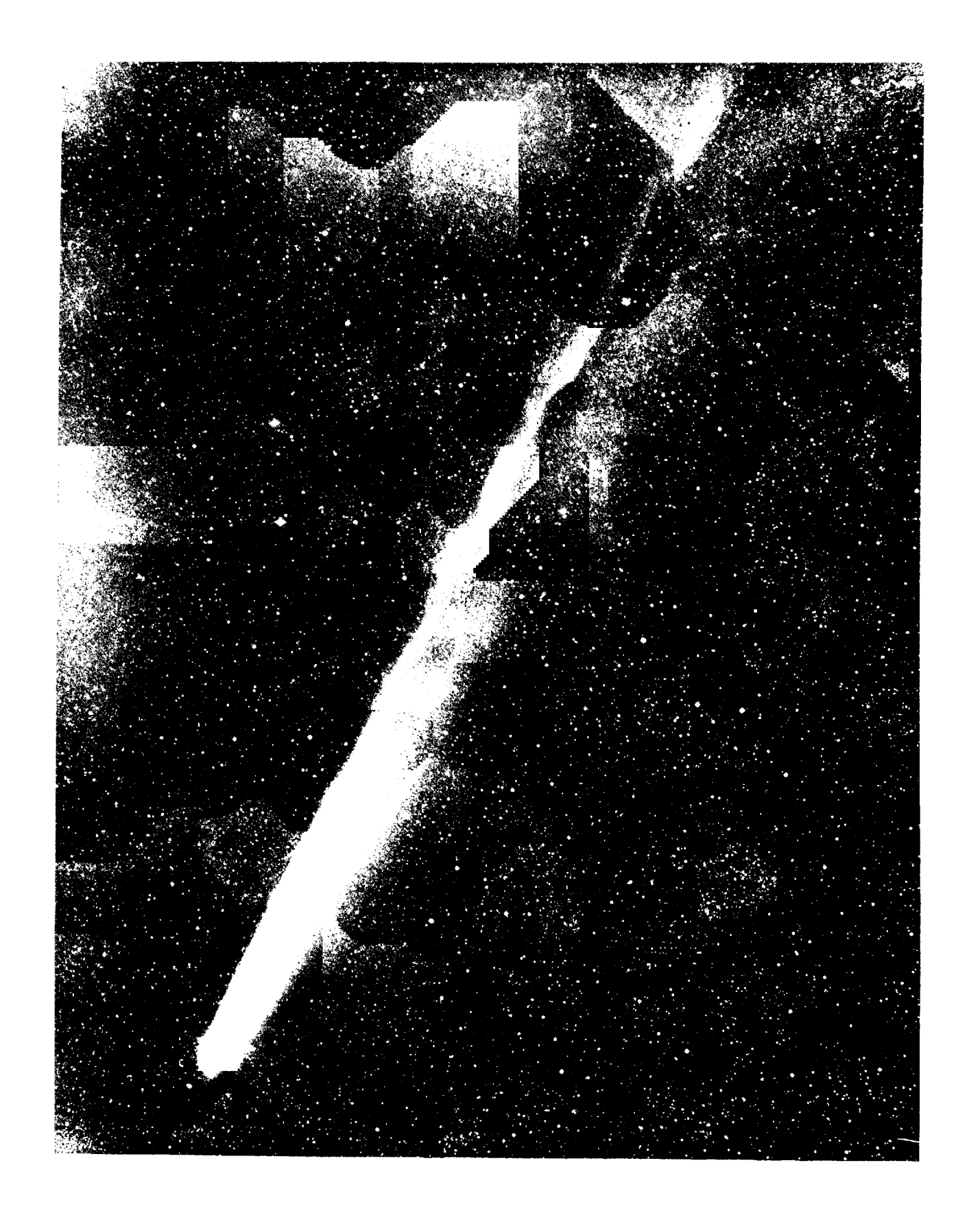
JOCR photograph of Comet Kohoutek on January 13, 1974. Compare with Figure 2. Figure 1.

https://doi.org/10.1017/S0252921100501031 Published online by Cambridge University Press