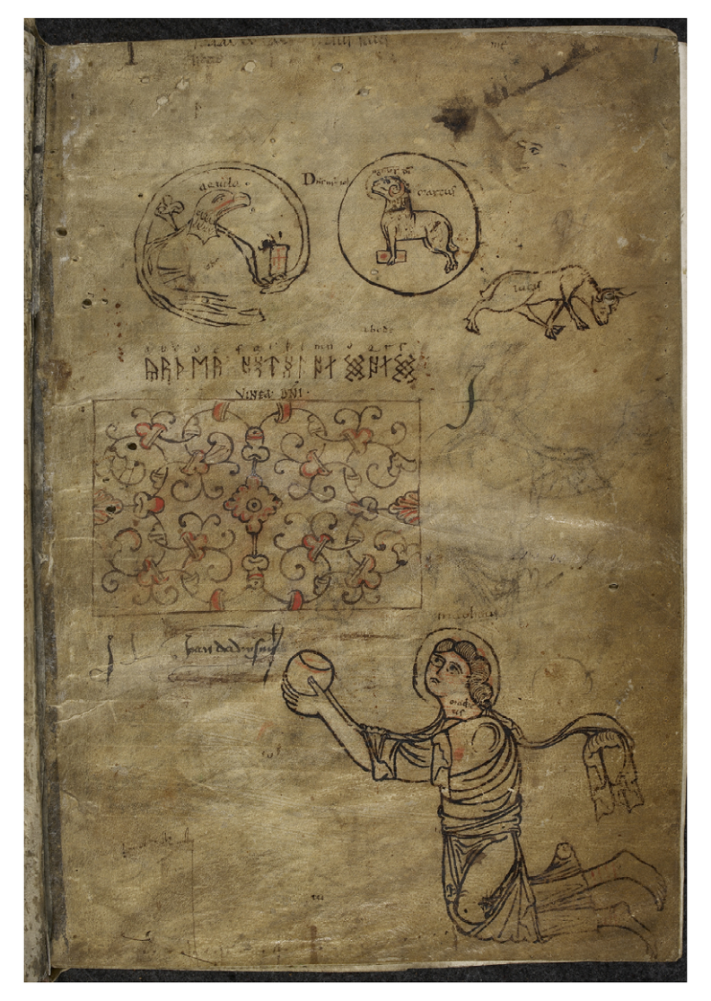
Figure 1: London, British Library, Add. MS 47967, fol. 1r. Reproduced by permission of the British Library

immediate successors. <sup>10</sup> However, whilst the decoration of the flyleaf is at a historical remove from the copying of the OEO , Stokes argues that an eleventh-century