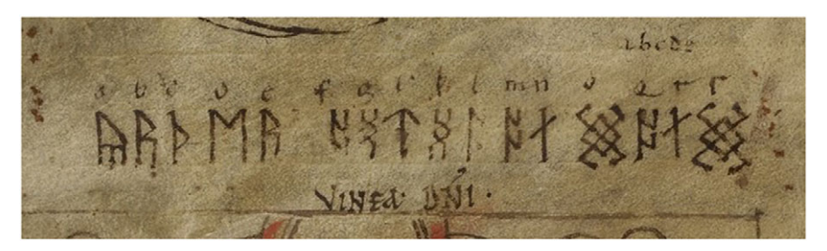
Figure 2: The Tollemache Orosius runic sequence, London, British Library, Add. MS 47967, fol. 1r.

The striking illustrations of the Tollemache Orosius flyleaf are accompanied by labels in a late-eleventh-century hand, which are important for identification of several of the images. In addition to bearing his name, the symbol of the evangelist Mark, for example, is clarified as a representation of the agnus dei rather than the usual winged lion with a short caption in Anglo-Saxon minuscules. By far the largest caption, however, accompanies the vine-scroll panel, which is labelled as VINEA DŃI ( vinea domini , or 'Vineyard of the Lord') in Roman majuscules, the prominence of the label reinforcing the impression that it is the vine-scroll that is central to the iconographical programme of the flyleaf. Adding to this heady mix of iconography, text and informal decoration is a prominent sequence of sixteen large runes from the Old English fupore , placed above the vine-scroll and below the symbols of John and Mark. Despite the fact that the same runic letters are repeated in close proximity, this runic sequence was apparently misconstrued as an alphabet sequence by a later annotator, who provided an inaccurate alphabetic gloss of each runic character up to 's' and captioned it with the label 'abcde' (see Fig. 2 below).<sup>12</sup>