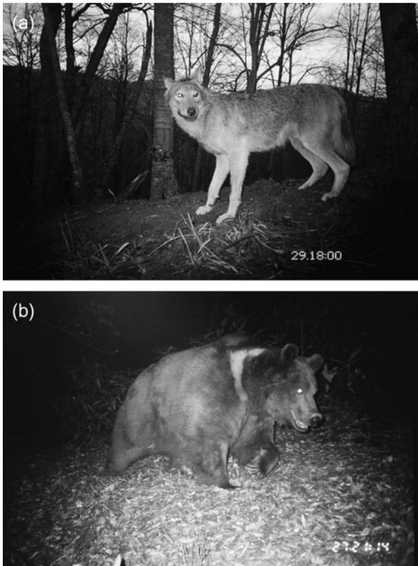
PLATE 1 Camera trap photographs of (a) wolf and (b) an adult male brown bear in Yaylacık Research Forest.

Yenice Forest is a major logging area, generating revenue for the State and the local communities; 73,000 m 3 of forest has been logged and an additional 24,000 m 3 of forest was cut for fire wood during 1999–2005 (Lise, 2005). The forestry service is currently considering selective logging in Yaylacık Research Forest and the political pressure from local communities to utilize this forest as a logging area is increasing. Yenice Forest is one the largest intact forest habitats in Turkey and an important area for the long-term conservation of wolf, brown bear, wild cat and roe deer. However, currently only 1.6% (c. 12 km 2 of 750 km 2 ) of Yenice Forest is protected. We urge the Turkish Ministry of Environment and Forestry authorities and Turkish nature conservation organizations to direct their attention to Yenice Forest, which is important globally because of its intact mammal fauna. We have presented our results to the Turkish Ministry of Environment and Forestry authorities and to the Turkish Nature Association (Doğa Derneği) and WWF Turkey, and we have recently begun new research on the ecology of wolf, brown bear and wild cat in Yaylacık Research Forest.