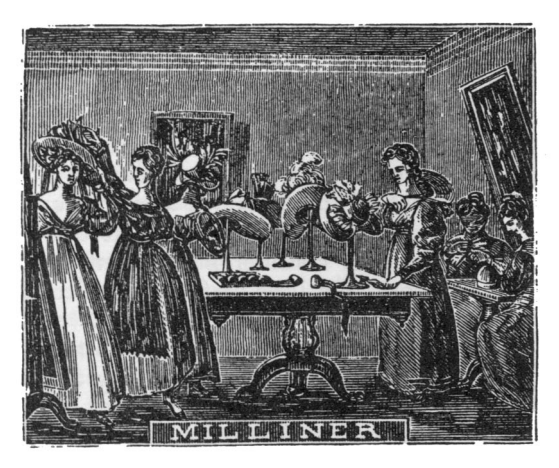
One of the few Occupations open to Girls