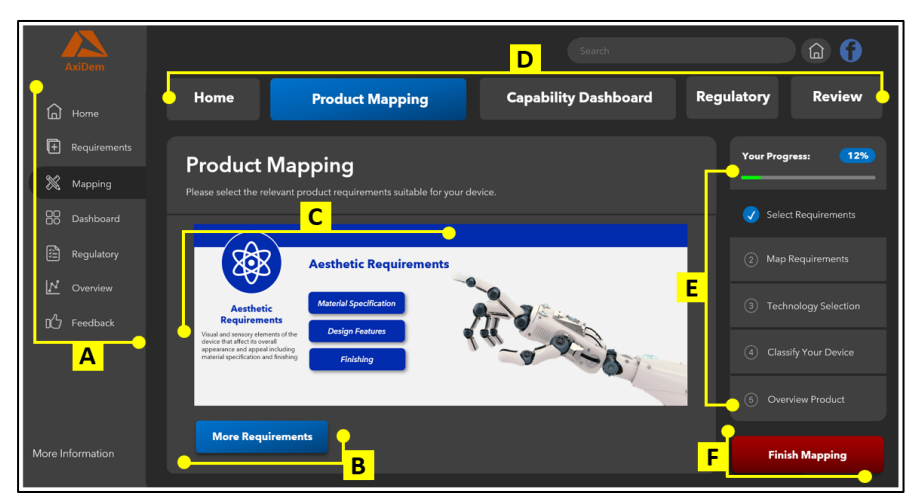
Figure 2. Main GUI of the AXIDEM prototype tool

Applications (VBA). VBA's advantage lies in its functionality as an event-driven programming language (Milicevic et al., 2013). This feature provides a high-level of responsiveness to the user's actions and enables trigger events based on the user's interactions with the interface, such as selecting specific requirements or accessing particular menus (Yadav et al., 2014). Upon launching the tool, designers are greeted with an initial user form, enabling them to input the product's requirements for the artefact they intend to design. Once the product mapping process is initiated, the primary interface is presented to the designer (see Figure 2).