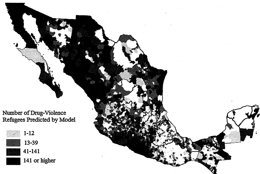
Figure 2 Geographic distribution of drug-violence refugees. This map shows the number of drug-violence refugees per municipality predicted by this paper. A darker area means more refugees. The four different shades were selected according to the distribution of refugees in four quartiles (1–12, 13–39, 40–141, and 141 and up).