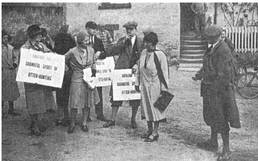
Figure 2. 'Demonstration at a Meet of the Bucks Otter Hounds', Cruel Sports , June 1931.