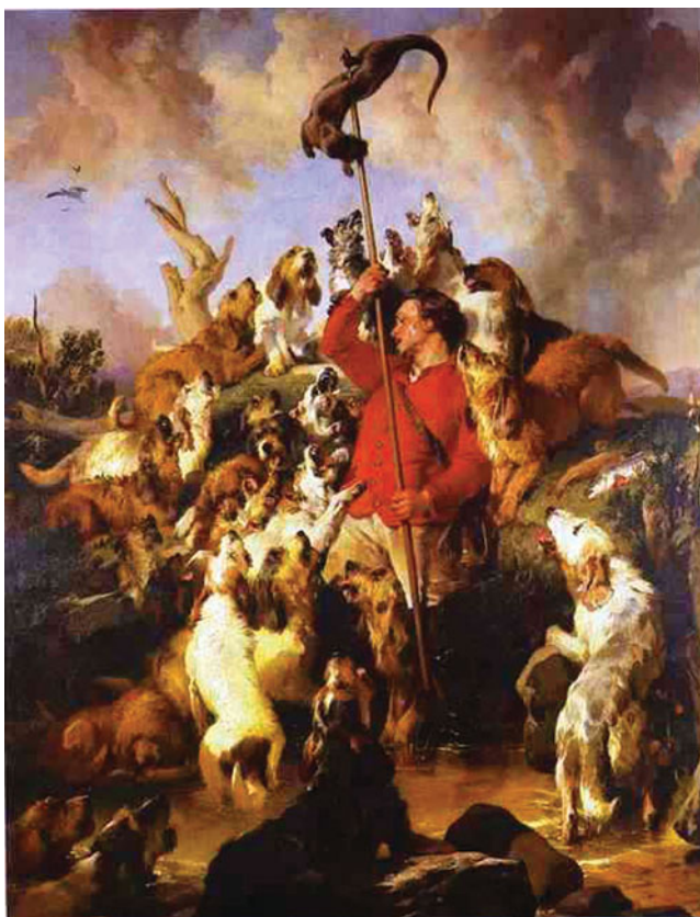
Figure 1. Sir Edwin Landseer, The Otter Speared, Portrait of the Earl of Aberdeen's Otterhounds, or the Otter Hunt , 1844; Laing Gallery, Newcastle http://www.twmuseums.org.uk/laing-art-gallery/collections.html .

John Mackenzie points out that Landseer did not 'decry human participation in the raw cruelty of the natural world. Human involvement is, rather, glorified as an imperative of command over nature, perfectly conveyed in The Otter Hunt .' 3 Ruskin's critique of the painting did little to diminish the popularity of Landseer's art in the nineteenth century and hunts, hunters and otter hunting increased substantially in popularity, reaching a peak in the Edwardian period. 4 The fifteen hunts in existence in 1880 had grown to twenty-two by 1910. 5 Spearing was no longer permitted in the popular modern form. Mr Collier's Otter Hounds were the last to abandon the spear in 1884, 'as his field did not care to see so gallant a beast suffer such an end'. 6 By the twentieth century most otter hunters spoke of the 'remote and barbarous days of the spear', 7 and broadly disregarded spearing as one of the 'blood-thirsty methods used by our forefathers'. 8 The seasonality, setting and pedestrianism of otter hunting appealed to Edwardian sporting and leisure sensibilities. Summer hunting across rugged river valleys offered strenuous physical exertion in the sun, whilst facilitating a picnic and a paddle. Otherwise inaccessible wild and watery landscapes could also be explored: 'in otter hunting, the hounds, the invigorating air of