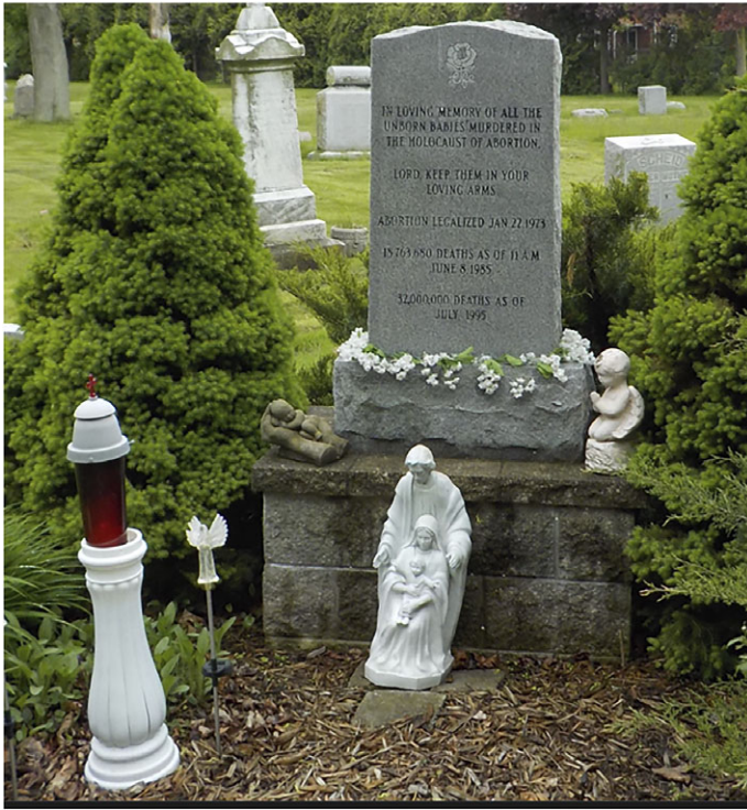
Figure 4. Grave of the unborn fetus (1973), Church of the Assumption Grotto.

and French origins. Interestingly, the grotto and the church grounds sit on a World War I and World War II German military cemetery.