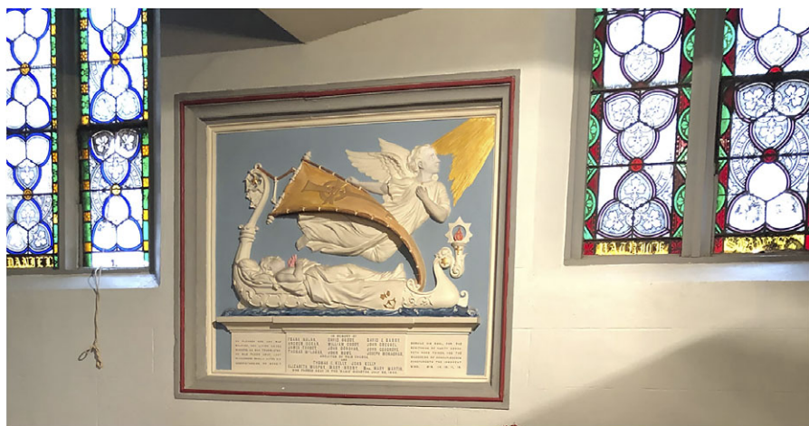
Figure 5. Holy Trinity Church.