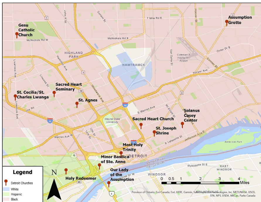
Figure 3. Map showing churches discussed in the text in relation to predominant race reported for 2010 census tracts. Census data downloaded from datadrivendetroit.org .