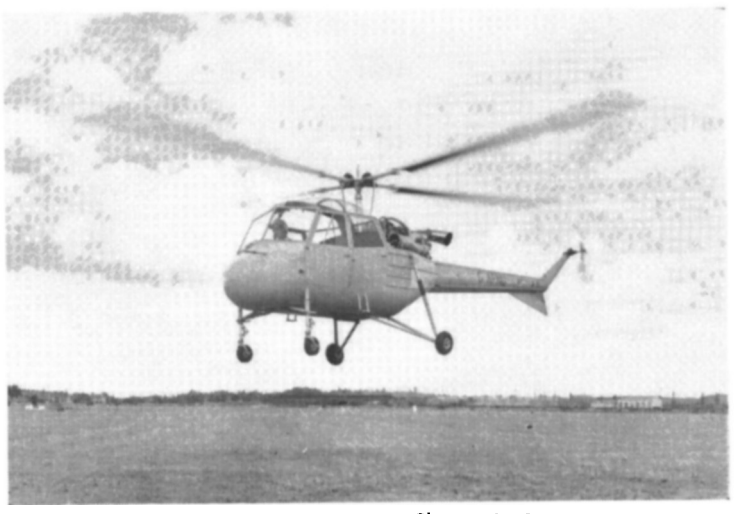
Photograph of P531