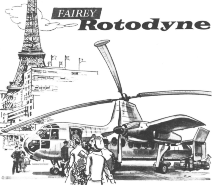
THE FAIREY AVIATION COMPANY LIMITED - HAYES - MIDDLESEX

straight down, to a safe arrival. A new conception in aircraft design has brought this kind of travel into plain sight—the Rotodyne which is neither aeroplane nor helicopter, but something of both, and the world's first Vertical Take off Airliner Note that it conforms to the safety standards internationally recognised for twin-engined fixed wing aircraft, i.e. it has full single engine performance and safety