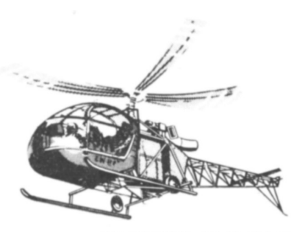
SUD-AVIATION 'ALOUTTE' II

All British shaft-driven helicopters in current production, as well as rotating wing aircraft now in production on the Continent incorporate ENV precision spiral bevel gears, ENV gears are also regularly furnished for aero engines,