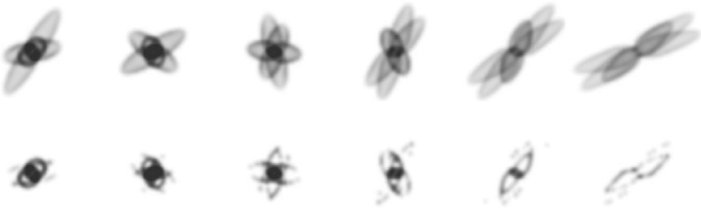
Figure 1. Perception of morphology is affected by viewing angle and sensitivity. Upper row: With the six angles in the model fixed, the viewing angle is changed from each image to the next by 15^\circ of i and 15^\circ of PA. Lower row: Each image is modified from the one above that the faintest pixels below one-third of the peak brightness are cut off. Brightness levels are shown in linear scale.