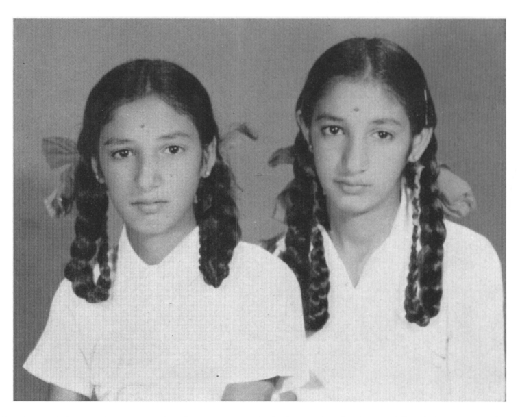
Fig. 3. Mainker sisters, also from Indore, normal twin pair, looking like 'two peas in a pod'