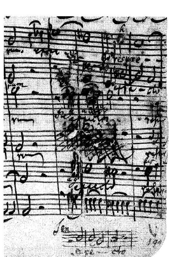
Figure 3 'Confiteor', bars 137-141, Source A

places in the latest autograph portion of the Art of Fugue , I decided to accept it.<sup>6</sup> Now Wolf reports that the sharp in fact comes from Emanuel's hand.<sup>7</sup> I see no real reason to dispute this, though the spacing continues to give me pause.