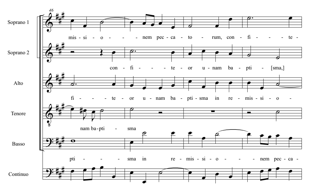
Example 2 'Confiteor', bars 46–49 (based on Johann Sebastian Bach (1685–1750): Messe h-moll BWV 232 , ed. Joshua Rifkin (Wiesbaden: Breitkopf & Härtel, 2006)). Used by permission

with a sort of rightward hook at its lower end. Emanuel at first also used this notation – Figure 1 provides an example – but later switched to German note names, representing C# as cis . But however we understand the letters, I find it hard to imagine that the change in bar 47 went in the direction claimed by Wolf.<sup>18</sup> For one thing, I would think it more likely for Bach to alter a fugue subject from its 'normal' form to a variant rather than the other way around. Bars 47–48, in fact, mark the first time in the movement that notes 2–4 of the subject depart from the pattern illustrated in Example 3a. Especially under these circumstances – and especially, too, since Bach had written the subject head in its customary form only one bar earlier and in the next-lowest voice – we could readily imagine that he first conceived, and started to write, soprano 2 as suggested in Example 3b, then supplanted this with the version of Example 2 because the harmony demanded an a' rather than a b' at the start of bar 48. I, for one, would want very strong evidence to persuade me that Bach would have altered this smooth line to the ungainly reading shown in Example 3c just to maintain the motivic consistency of the dotted figure.