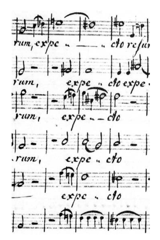
Figure 6 'Confiteor', bars 137-140, Source G

speculate as to why the copyists did not notice this staff. Possibly the crossing-out was at first not so clear as it is today and the copyists tried still to read the principal staff – and came to grief.