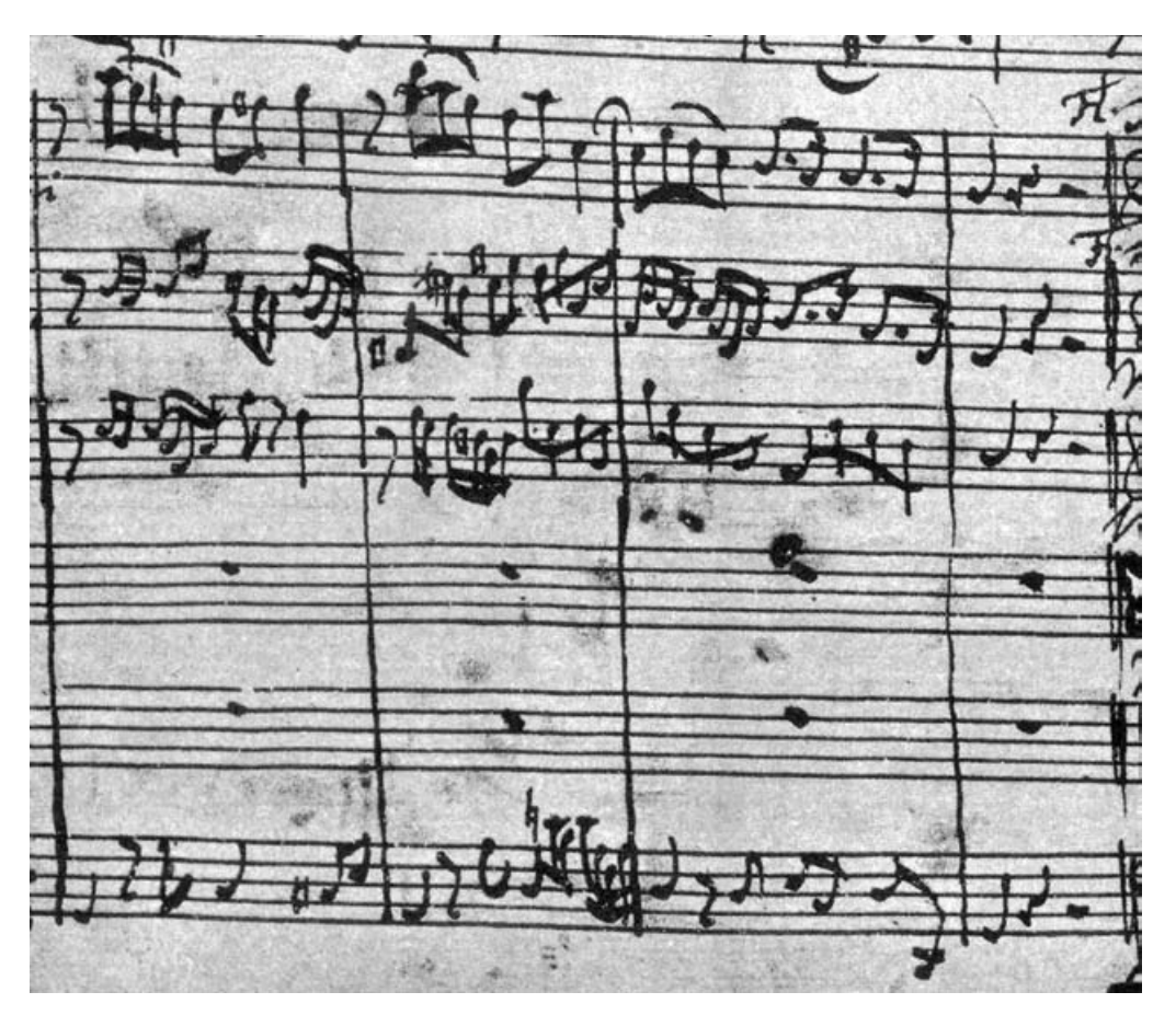
Figure 2 'Et in unum Dominum', bars 77-80, Source A