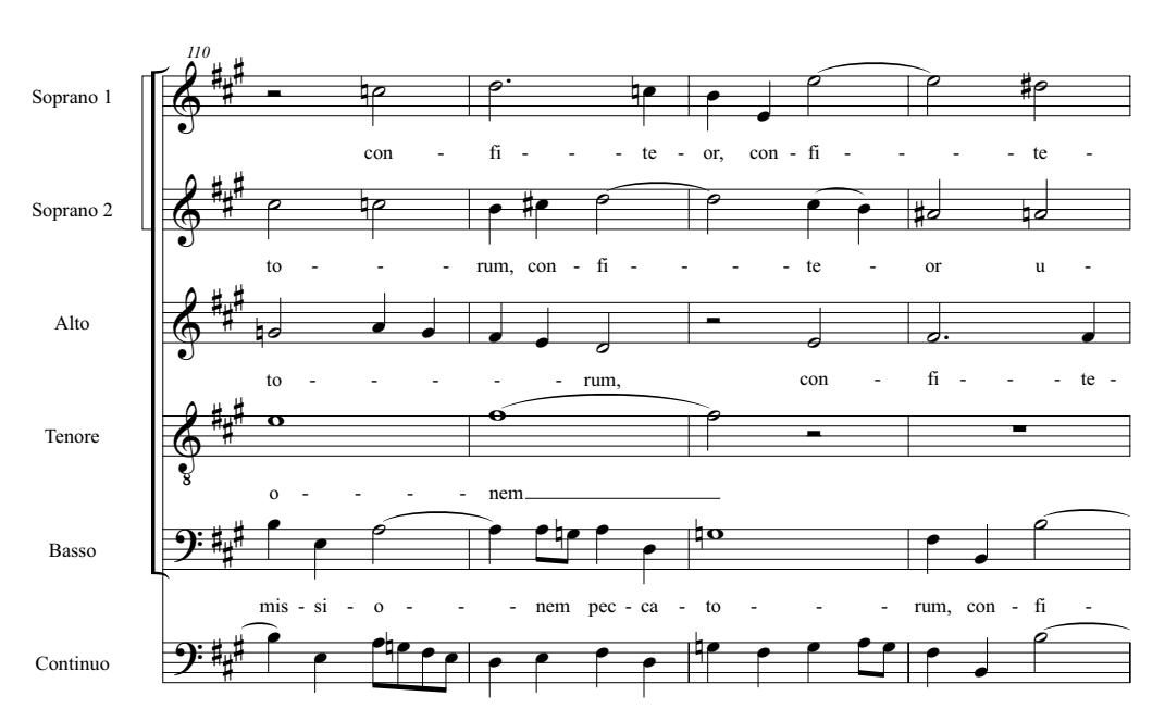
Example 5 'Confiteor', bars 110–113 (based on Johann Sebastian Bach (1685–1750): Messe h-moll BWV 232 , ed. Joshua Rifkin (Wiesbaden: Breitkopf & Härtel, 2006)). Used by permission

replaced this version with that of Example 3c would have meant undoing that precedent without compelling motivation.<sup>19</sup>