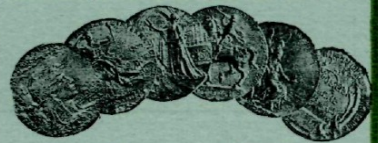
Gold Medal (Highest Award), Allahabad 1910.

GRANDS PRIX : Paris 1900, Brussels 1910, Buenos Aires 1910.