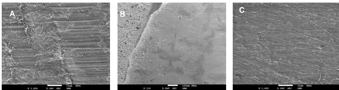
Fig.3- A) SEM image of Group B Enamel surface after remnant adhesive removal with tungsten carbide bur: horizontal risks are formed within the horizontal grooves. Some unpolished areas can be observed as a result of smear layer deposition. B) SEM image of Group C Enamel surface after remnant adhesive removal with Sof-Lex™ polishing discs: polished remnant adhesive is present on the left side, and a thin remnant adhesive layer with an homogeneous smooth appearance is formed in areas where nearly all adhesive was removed (right side). C) SEM image of Group C Enamel surface after remnant adhesive removal with Sof-Lex™ polishing discs: polished surface is present with small risks dispersed all over the enamel.