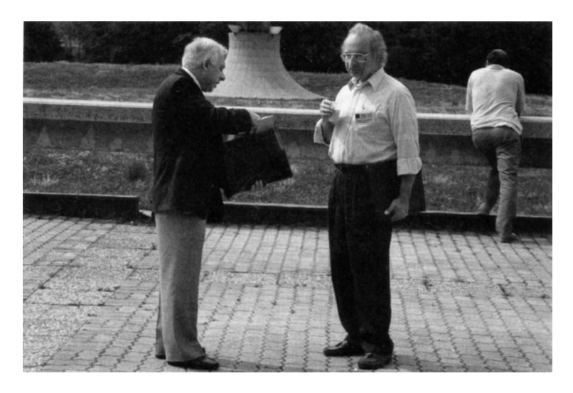
Y. TERZIAN, S.R. POTTASCH