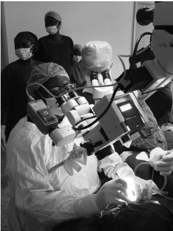
Fig. 3. Intra-operative training of the local staff by a visiting team.

common to all surgical training programmes (Figure 3). In addition, the ear camp should provide the opportunity to run temporal bone dissection courses and tutorials.