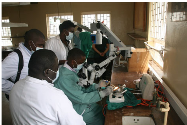
Fig. 1. Temporal bone dissection course at Mulago Hospital, Uganda.

many lower- to middle-income countries, the power supply is prone to fluctuations. This can lead to blowing bulbs on microscopes and electrical damage to equipment, which in turn may prove difficult or expensive to replace. The use of a surge protector through which the power is channelled can help prevent fluctuations, but is not a guarantee against damage. Furthermore, the power requirements are large, given the amount of electrical equipment required.