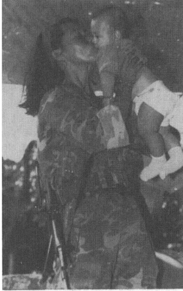
AFP photo from The Morning After