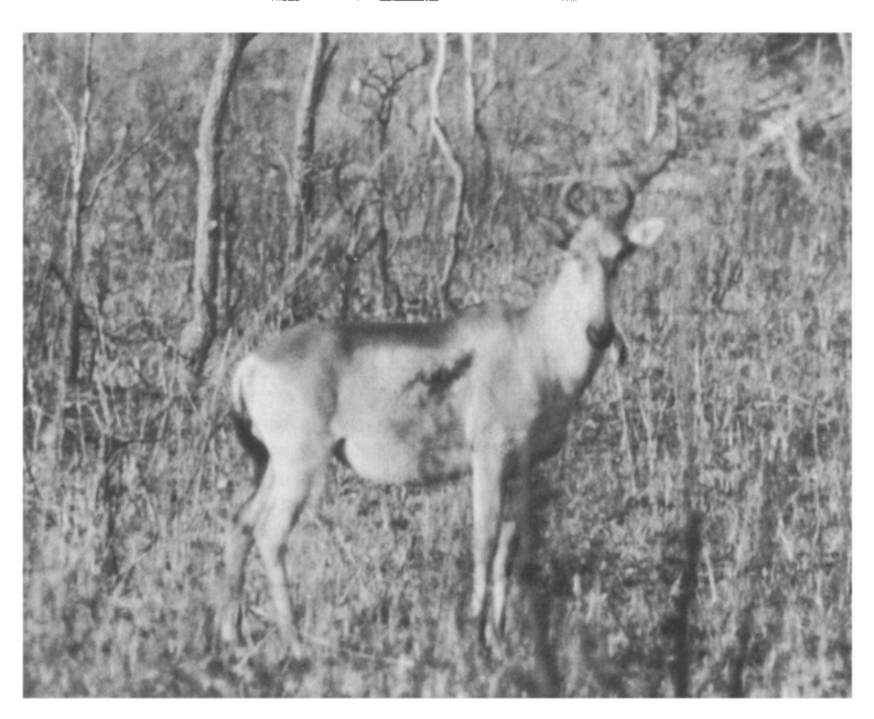
Lichtenstein's hartebeest.