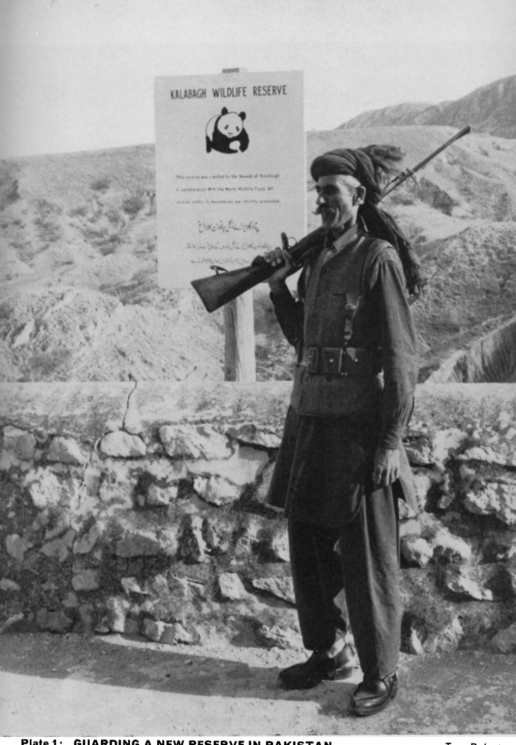
Plate 1: GUARDING A NEW RESERVE IN PAKISTAN