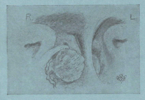
Right Antral discharge seen by Endo-Rhinoscope (DR P. WATSON-WILLIAMS' CASE)

Price £7, 18s. 6d. Rubber Stamp, 6/6 extra