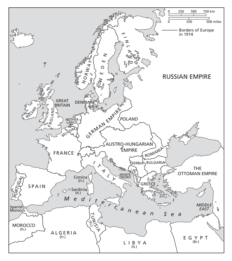
Map 1. Europe and the Ottoman Empire, 1914

Tsarist Empire. Many parts of the Middle East belonged to the Ottoman Empire, though Egypt was under British suzerainty, Libya under Italian control, and Tunisia, Algeria, and Morocco under French and Spanish rule. Apart from Siam (Thailand) and the Empire of Japan, almost all Asian countries were either colonies or protectorates of imperial powers. China was disintegrating into an ever-changing system of feuding warlords after the anti-Qing revolution in 1911/12, and South Asia was divided into multiple, mainly British, colonial possessions and hundreds of princely states. With the exception of Ethiopia, all of sub-Saharan Africa was under British, French, Belgian, German, or Portuguese imperial rule.