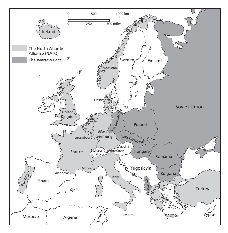
Map 3. American and Soviet alliance systems in Europe, 1955

a decade, did not reverse Europe's division into two hostile alliances, even if Moscow had hoped it would at least reduce Cold War tensions.<sup>31</sup>