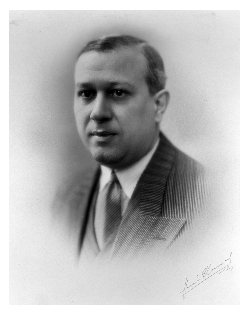
Figure 1 Henry E. Sigerist