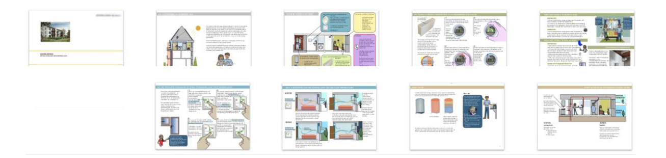
Figure 4. Image-based information for residents that includes the connection between physical interface elements and the residents' own actions in their home. Here too, the depiction is deliberately small because it is not about the details but the overall idea.