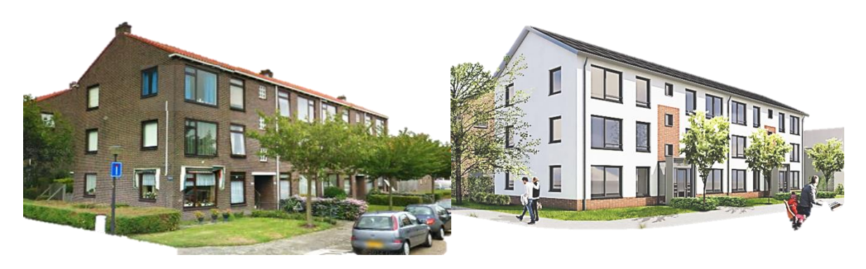
Figure 1. Before- and after depiction of the completed zero-energy pilot renovation of a block of 12 flats from 1951.