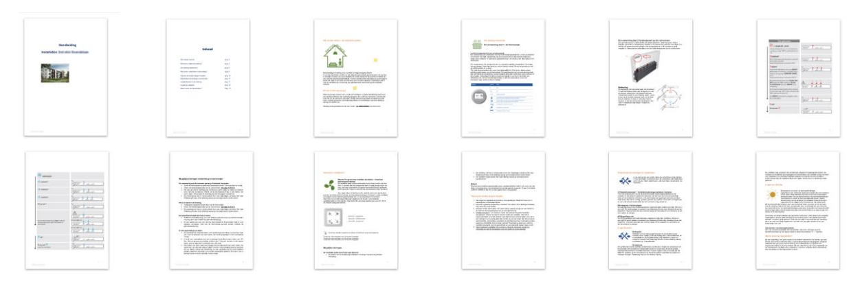
Figure 3. Text-based, isolated information about physical interface elements for residents of their home. The depiction is deliberately small here because it is not about the details but the overall idea.

broader idea of a service interface because all these heterogenous aspects affect the residents' understanding and ability to interact with their home. The aspects thus benefit or pose risks to the overall impact goal. In this case, the physical interface elements to use system functions were incompletely aligned. Only the user manual could still be influenced at this implementation stage. In consequence, it acquired an important role in the service interface, and consequently in my collaboration with the construction and installation stakeholders. Here too there was frequent switching between making it as simple as possible and letting it show effective use of the home given its technical complexity. Initially, the installation and construction stakeholders insisted on compiling the user manual. The manual they created for the residents to use their systems looked like this, in overview (Figure 3): it largely relied on descriptions in text and partially adopted the descriptions of the original systems without adapting them to their changed functionality.