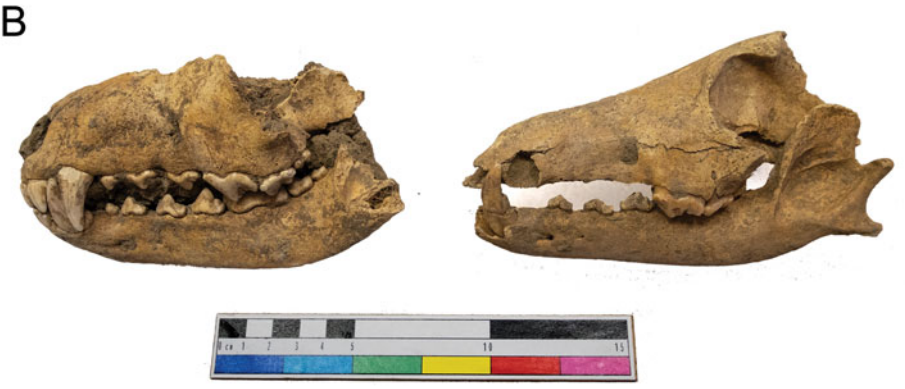
Figure 2. A: mandible (left) of Dog 36a (top left), Dog 1a (top right), and Dog 3a (bottom); B: cranial remains of Dog 36a (left) and Dog 1a (right).

least two years old at death; for 3a, the fusion of the distal radial epiphysis indicates a dog at least eleven months old (Silver, 1969: 251–53).