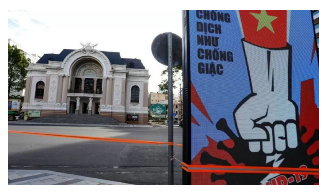
Figure 5. An electronic screen displays a propaganda poster with the slogan Chống dịch như chống giặc (Fighting the pandemic like fighting the invader) in Ho Chi Minh City. The drawing here was inspired by a propaganda poster produced during the Vietnam War.

Eric San Juan, 'Vietnamese propaganda art sees revival in fight against COVID-19', Agencia EFE (24 April 2020), available at: {https://www.efe.com/efe/english/portada/vietnamese-propaganda-art-sees-revival-in-fight-against-COVID-19/50000260-4229603}.