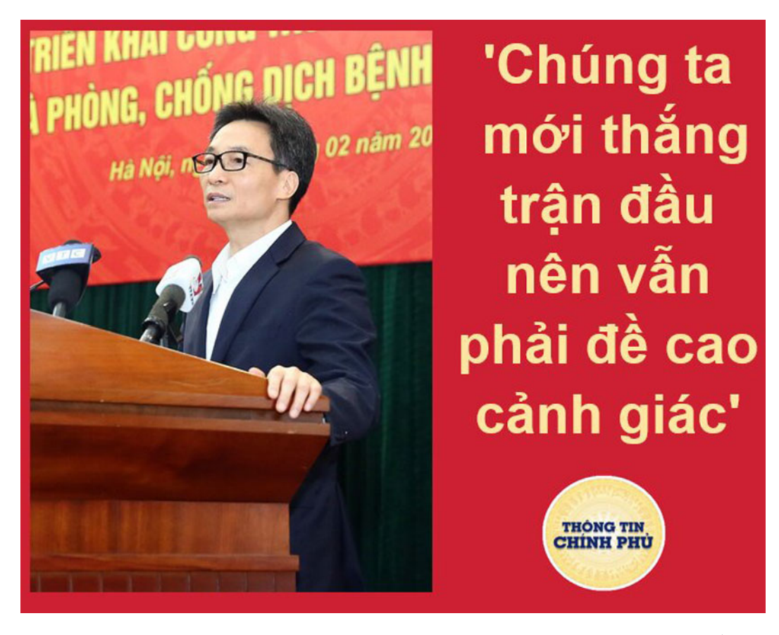
Figure 2. A photo uploaded to Facebook by the account Thông tin chính phủ , which shows Acting-Health Minister Vũ Đức Đam making a speech. The caption of the photo reads: 'We only won the first battle, so we should remain vigilant'.

in an official meeting in April 2020 that 'Every business, every citizen, every residential area must be a fortress to prevent the epidemic.'87