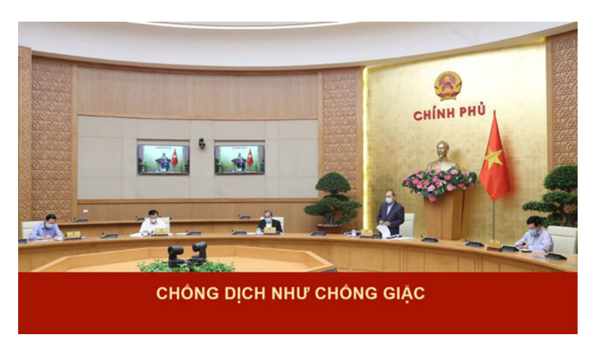
Figure 1. The cover photo of the Facebook page of the account Thông tin chính phủ on 28 March 2020. The slogan Chống dịch như chống giặc (Fighting the pandemic like fighting the invader) is printed on the cover photo of the account.

The government's official Facebook page, Thông tin chính phủ , was the primary account used to promote the securitisation of Covid-19. For instance, on 28 March 2020, Thông tin chính phủ changed its cover photo to a photo of a government meeting on Covid-19, with the printed caption Chống dịch như chống giặc (see Figure 1). On Vietnam's Doctor Day in 2020, the same day that Phúc spoke highly of 'white-bloused soldiers', the account shared excerpts from Đam's speech at a conference hosted by the Ministry of Health. A quote from the speech was chosen as the caption for the photo uploaded along with the post: 'We only won the first battle, so we should remain vigilant' (see Figure 2).<sup>84</sup> As noted, this was something that he had been stressing to the public.