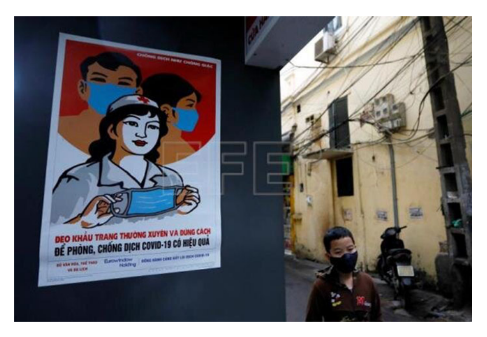
Figure 4. A propaganda-style Covid-19 poster in a street in Hanoi with the message: 'Wear mask regularly and correctly to prevent the Covid-19 pandemic effectively'.

Eric San Juan, 'Vietnamese propaganda art sees revival in fight against COVID-19', Agencia EFE (24 April 2020), available at: {https://www.efe.com/efe/english/portada/vietnamese-propaganda-art-sees-revival-in-fight-against-COVID-19/50000260-4229603}.