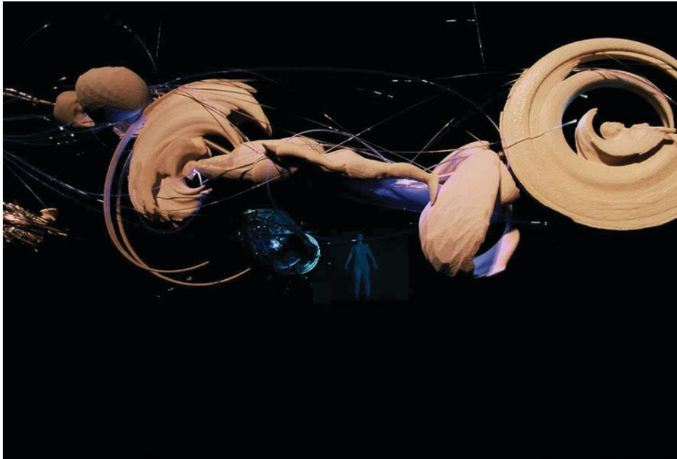
Figure 13. Kinocognophore by Claudia Bucher. Detail view of 3D-printed bone, with Bucher's body as adult stem cell. The Center for TransCognitive Imaging, Art Center College of Design, Pasadena, California, 2003.

The dripping recurred in two other hanging containers, leaking milk from one and motor oil from the other, leaving tiny liquid pools on the ground.