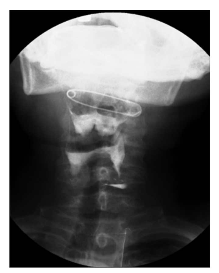
Figure 1: Modified Barium Swallowing Study

The computed tomogram (CT) scan of the head without contrast showed chronic white matter disease with no acute findings. A modified barium swallow (MBS) study was done which indicated a mechanical breakdown of esophageal phase of swallow with poor opening of upper esophageal sphincter (UES) (Figure 1). Nevertheless there was neither hypolaryngeal excursion nor aspiration. Following the results of MBS a contrast CT scan of the neck was performed which showed no obstructive or mass lesion consistent with the findings on MBS study. A magnetic resonance (MR) study of the brain was completed which showed a very small focus of restricted diffusion in the left posterolateral medulla at the junction of pons and medulla adjacent to the left anterior-inferior portion of the 4th ventricle (Figure 2). Magnetic resonance angiography of the head and