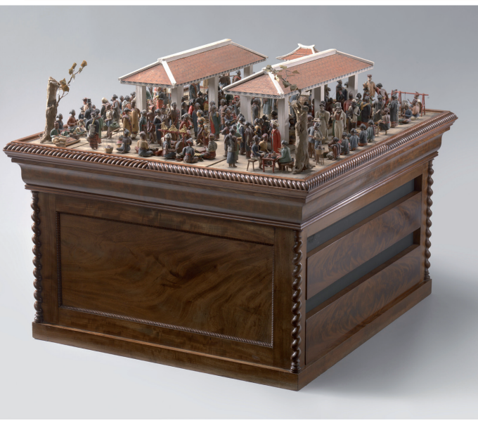
Javanese market, c. 1830–1860, anonymous. Model of a double market gallery consisting of Javanese pendopo pillars and Dutch roof tiles. Intended as souvenir for European travelers. Courtesy of the Rijksmuseum, Amsterdam, object NG-2009-134.

Itinerario , founded in 1977, offers a publishing platform for research on the history of European Expansion in both its Western and Non-Western contexts, and its impact on World History in general.