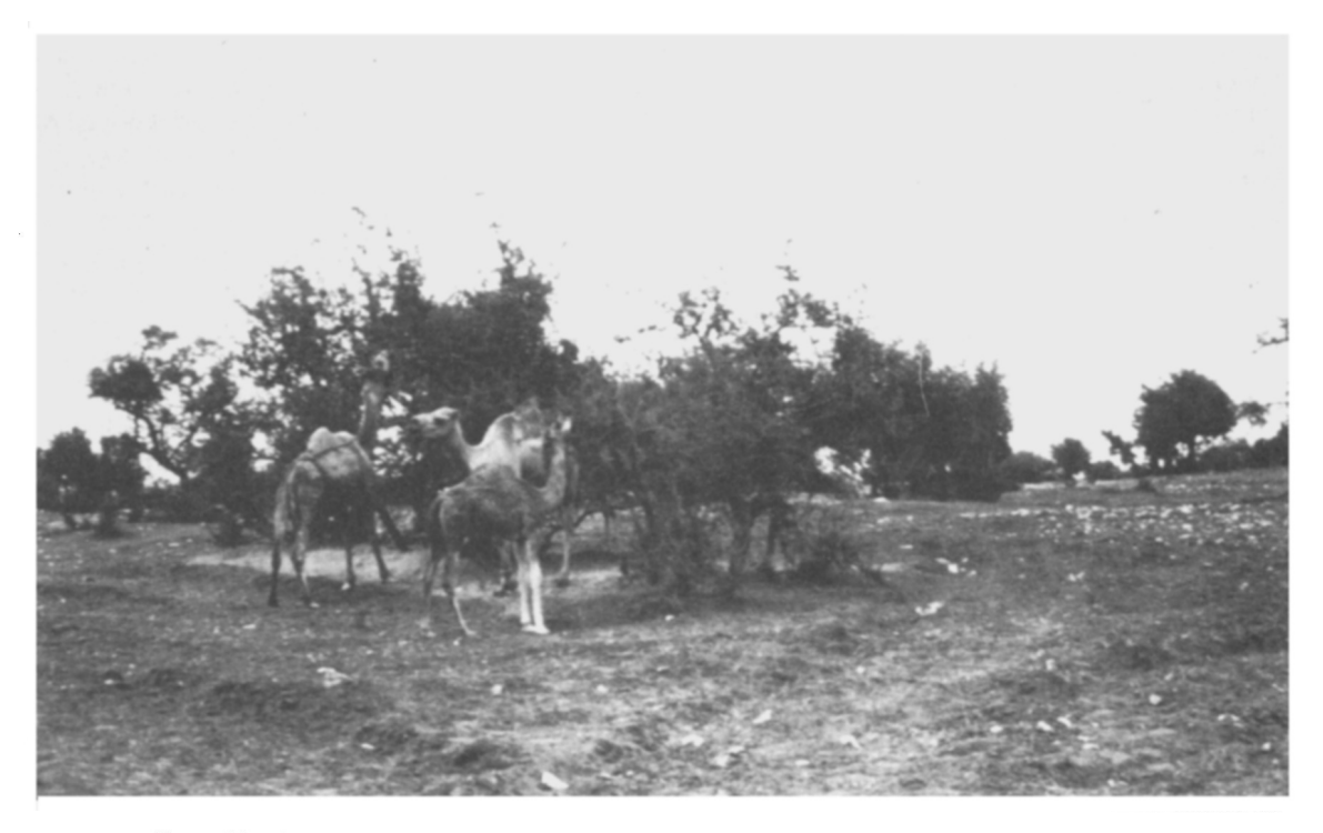
Above: Hundreds of camels from the Sahara contribute to the problem of over-grazing ( J. Mellado ). Below: Well preserved argan forest still occurs in the foothills of the Atlas mountains, but the flatter areas in the foreground are severely damaged ( J. Mellado ).