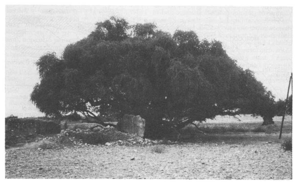
An old argan tree; the tallest specimens still remaining on the Souss plain are usually close to human habitation (J. Mellado).

and Anti-Atlas mountain ranges in south-west Morocco. The valley is closed at the east, where