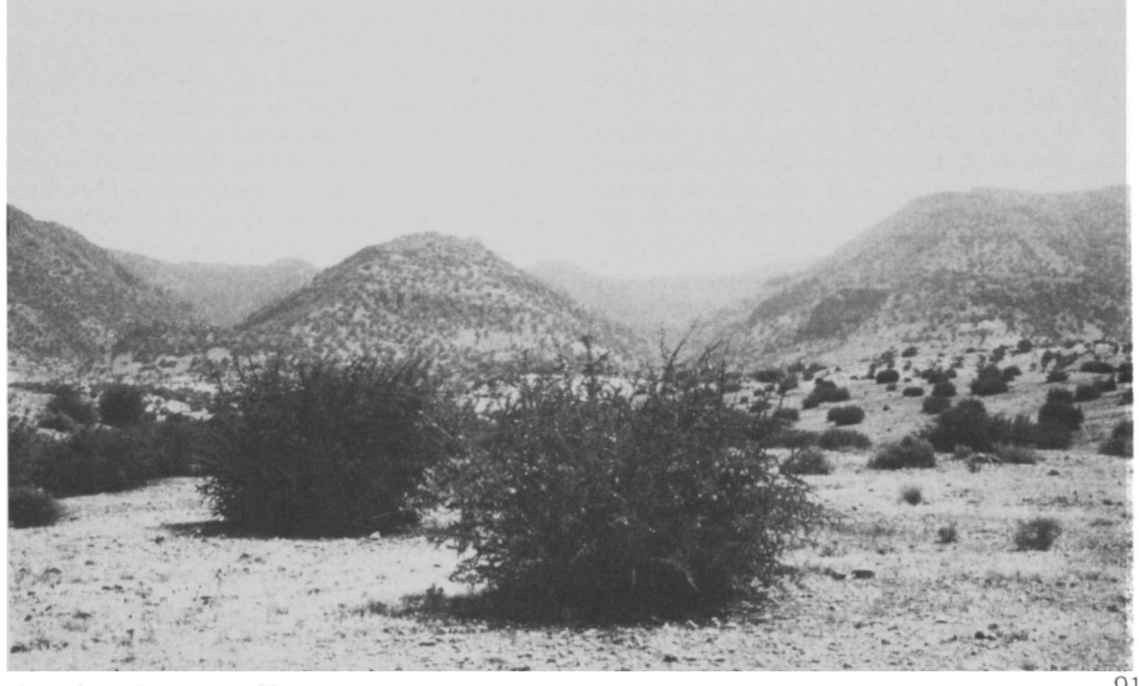
Argan forest destruction in Morocco