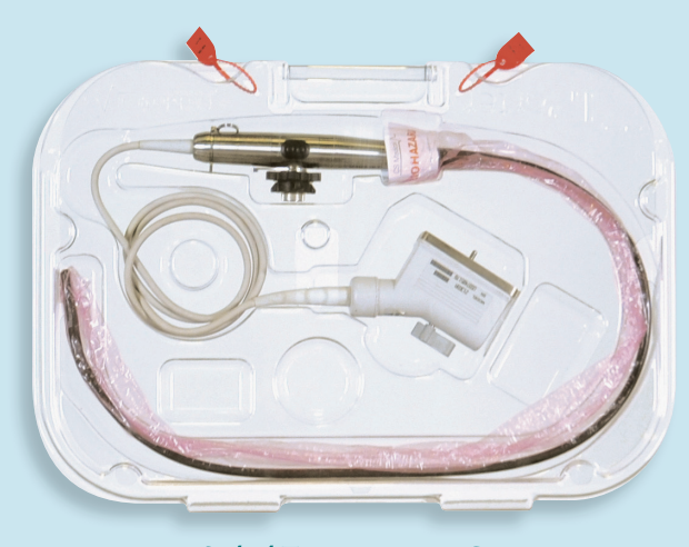
Soiled Transportation Case