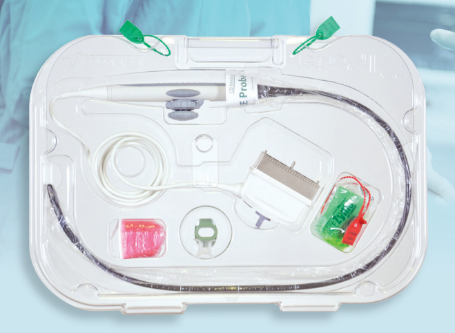
Procedure Transportation Case

TPorter TEE Ultrasound Probe Transportation and Procedure Case is designed to effectively and securely move high-level disinfected TEE ultrasound probes to the procedure area and then return the biologically soiled TEE ultrasound probe for reprocessing. TPorter features a variety of molded compartments to accommodate the TEE ultrasound probe, bite block(s), a PullUp™ Bio-Barrier Sleeve and a TEEZyme® enzymatic sponge.