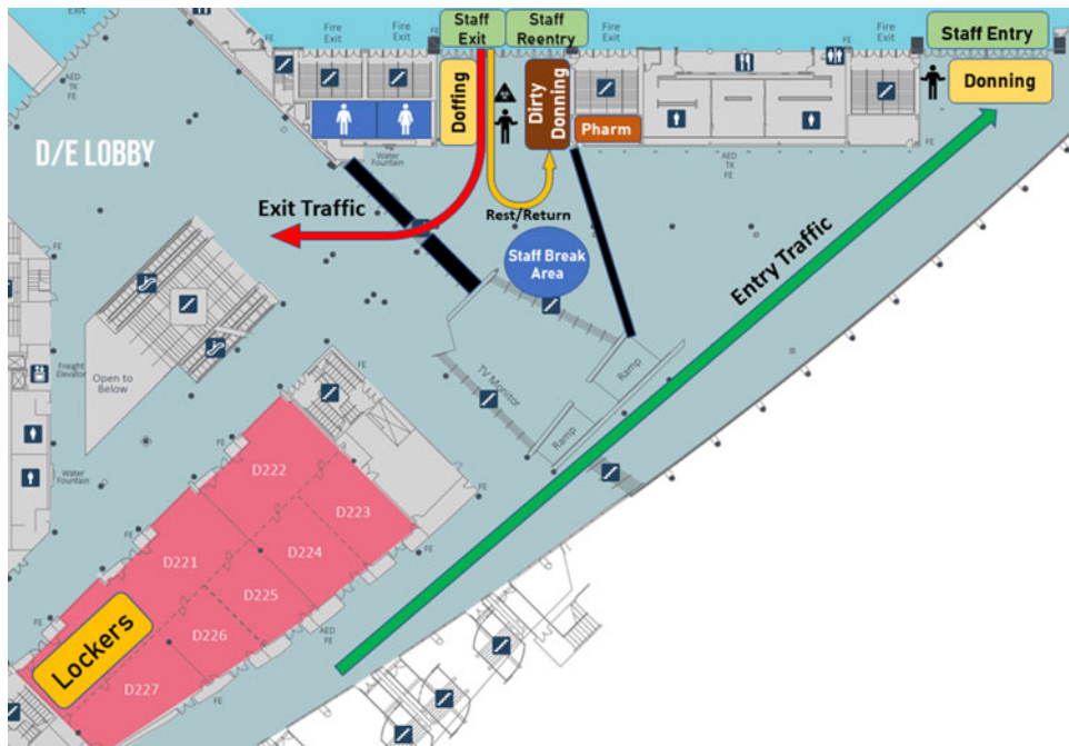
Diagram created by Hockaday et al.

PPE donning and doffing are crucial for infection prevention and maintaining the health of the workforce but can be intimidating and complex to those not familiar with the procedures. Thus, when creating the Federal Medical Station, staff from all levels were recruited to actively participate in the planning,