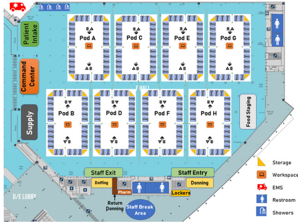
Diagram created by Hockaday et al.

The section of the convention space detailed in Figure 2 was designated as a retrofitted area for donning and doffing of PPE. Preexisting fire exits and restrooms provided a barrier between the 2 points of entry. Three tents were to be constructed: 1 tent at the first entrance (intake donning) and 2 tents at the second entrance (doffing and re-donning). Trained attendants were to be stationed in each tent to assist with donning, redonning, and doffing.