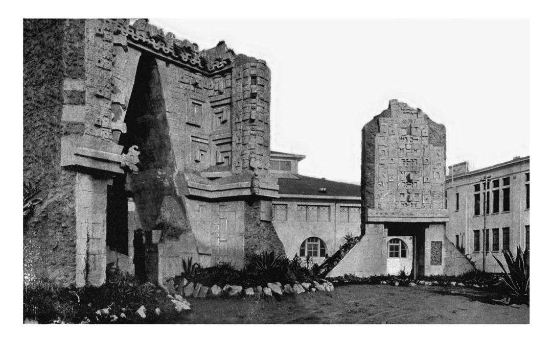
Figure 4. William Rand and Andrew McNally, 'Ruins of Yucatan'.

project, especially in the large haciendas of central and southern Mexico.<sup>86</sup> Thus, Mexico's official Indianism managed to separate the 'glorious' past of the Mayas and Aztecs from the deplorable reality of contemporary indigenous groups. Díaz was nevertheless worried about Mexico's perceived exoticism at the world's fairs, as exemplified by the widely mocked Casa Azteca at the Parisian habitation humaine exhibition. As Tenorio Trillo has remarked, Díaz especially feared that Mexican Indians would be ridiculed at the fairgrounds.<sup>87</sup>