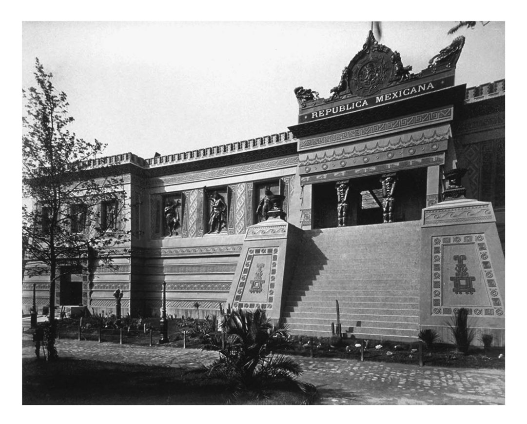
Figure 3. 'Pavilion of Mexico, Paris Exposition, 1889' (albumen print).

mentioned some 'eminent antiquarians', as well as contemporary historians, as his sources of inspiration.<sup>69</sup> However – and this is probably the most astonishing feature of this short text – Peñafiel was conscious of the one-sided nature of this kind of historiography. After stating that 'the history of the conquest of Mexico was written by the Spaniards themselves', he attempted to show an alternative perspective, by giving voice to the post-conquest Aztec chronicler Fernando Alvarado Tezozómoc and making ample use of recent archaeological findings. In this early version of a 'vision of the vanquished', he relied especially on the writings of the German ethno-historian and linguist Eduard Seler, one of the most respected experts of pre-colonial Mexican culture at the time, and also an active participant at the Congress of Americanists in Paris, where he almost certainly met Peñafiel.<sup>70</sup> Thus, as several sections in Peñafiel's Monumentos del arte mexicano antiguo reveal, the design of the Aztec Palace was partially based on the work of this German scholar, whom he called a 'distinguished friend'.<sup>71</sup> In spite of his defence of the 'heroic Aztecs', he did not wish to fully integrate Aztec history into Mexican