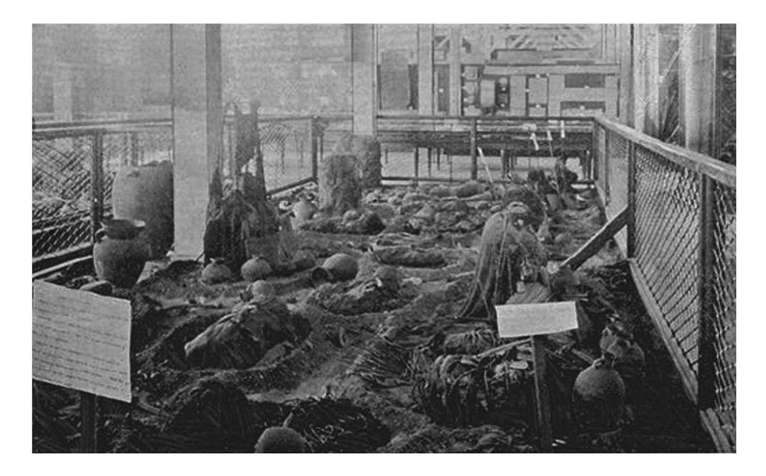
Figure 5. 'Ancient Peruvian burial ground'.

alike (Figure 5).<sup>113</sup> One visitor even claimed that the sight of 'ancient Peruvian cemeteries, whose hideous mummies, swathed and unswathed, sat in ghastly groups', had given him nightmares for a week.<sup>114</sup>