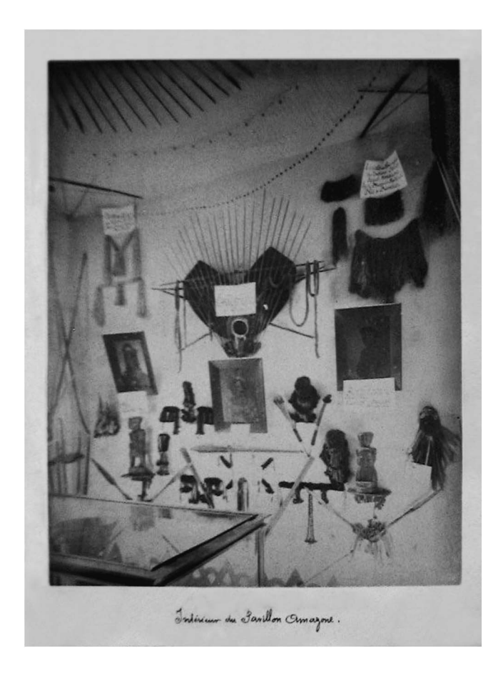
Figure 1. 'Interieur du Pavillon Amazone' (albumen print, 21×17 cm, 1889).

ethnology, and anthropology in South America. Netto also participated actively in global scientific debates, wrote several articles for European academic journals, and was a much-respected member of the scientific community of his time.<sup>43</sup> The museum's display in Paris consisted of various ceramics from the Amazonian island of Marajó, as well as bones, weapons, jewellery, and crafts which had been made by supposedly 'civilized' Indians (Figure 1).<sup>44</sup>