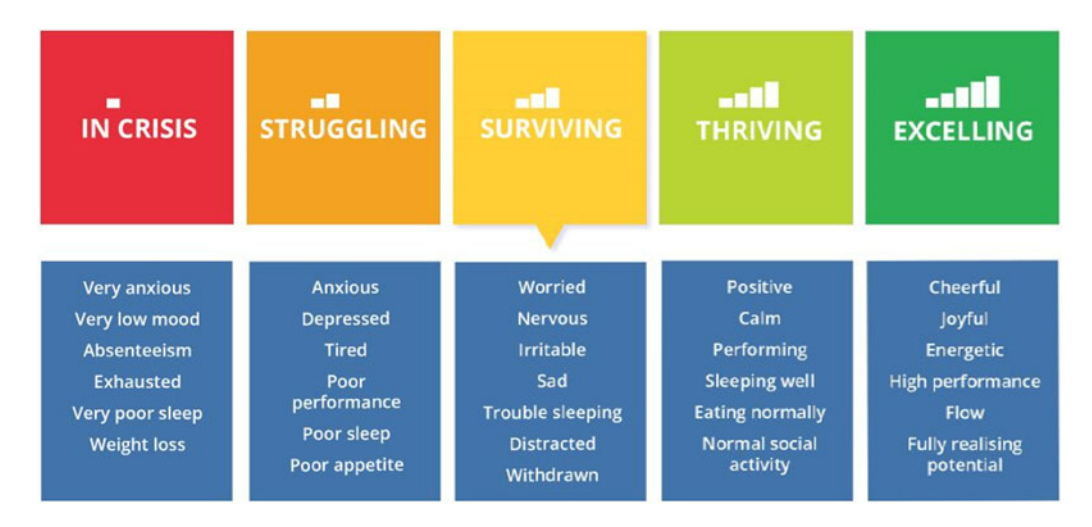
Figure 2: Mental Health Continuum Model created by Delphis, a mental health course provider 10

• Give more, be kind to others and make sure to be kind to yourself!